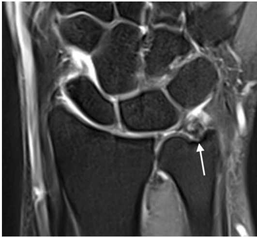
Fig. 1 Coronal T2-weighted wrist MRI showing a TFCC tear (arrow)