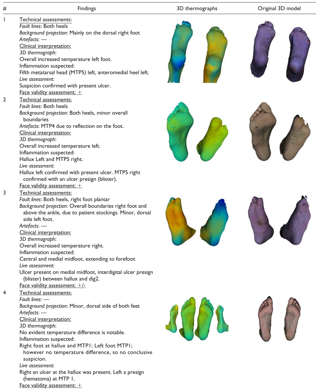
Table 2. An Overview of All the Cases With Face Validity.