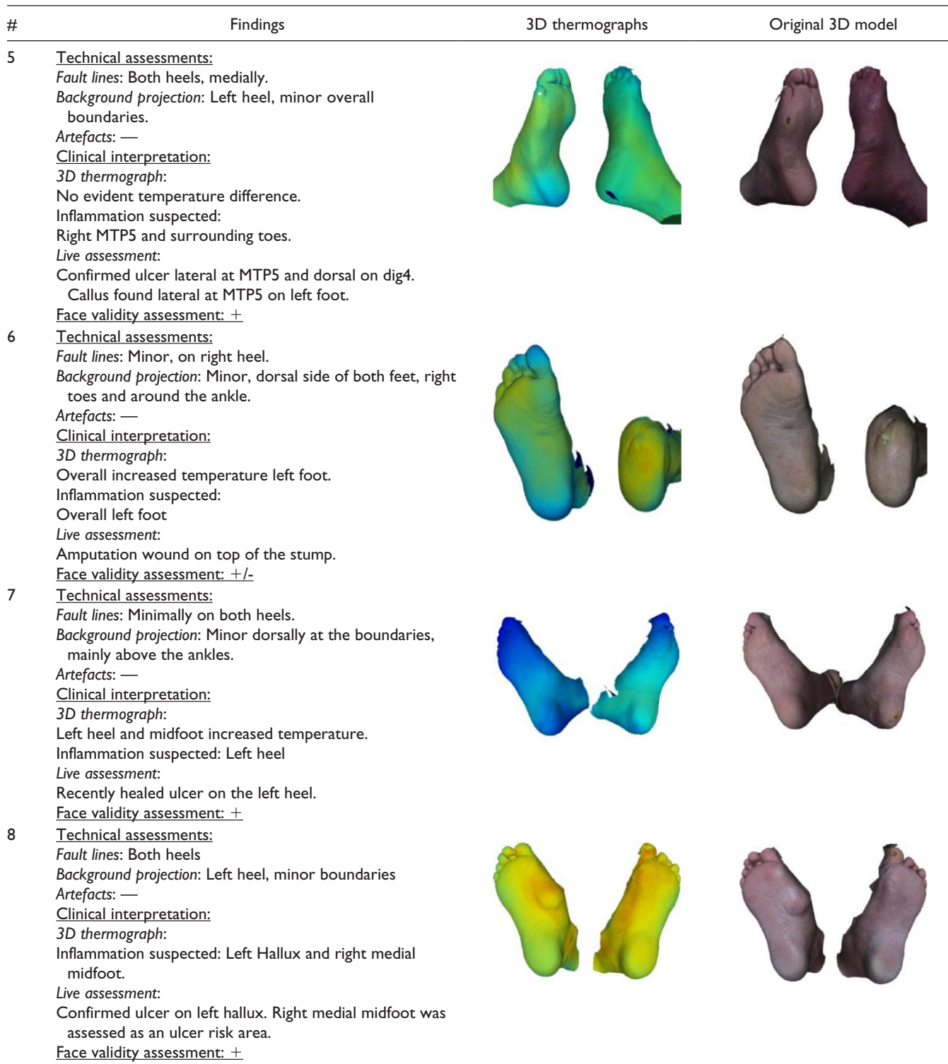
Table 2. (continued)

To support the clinical interpretation, static images are shown. See Figure 2 for the temperature scale. The corresponding rotatable 3D PDF thermographs can be found in the supplementary files 1 to 8. The 3D view can only be enabled in an Adobe PDF viewer after accepting to trust the document. As the 3D thermography system is still an experimental setup some technical errors are present and reviewed in the technical assessment. The fault lines, dark blue background projection, and additional artefacts are highlighted. First clinical assessment the interpretation of the 3D thermographs from experience clinicians are stated with suspected locations and compared with the live assessment.